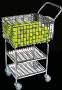
HEAD Teaching Cart

Receive 15% off* HEAD Penn teaching accessories listed below from May 2, 2011 - July 29, 2011. Email teamhead@us.head.com for an order form or call into Team HEAD to place your order and reference code UAU to take advantage of this offer. 1-800-289-7366 Option 1