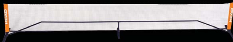
HEAD Net & HEAD Replacement Net