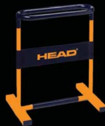
HEAD Racquet Holder