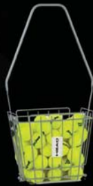
HEAD 85 Pro Teaching Basket