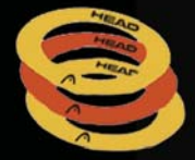
HEAD QST Ring Targets