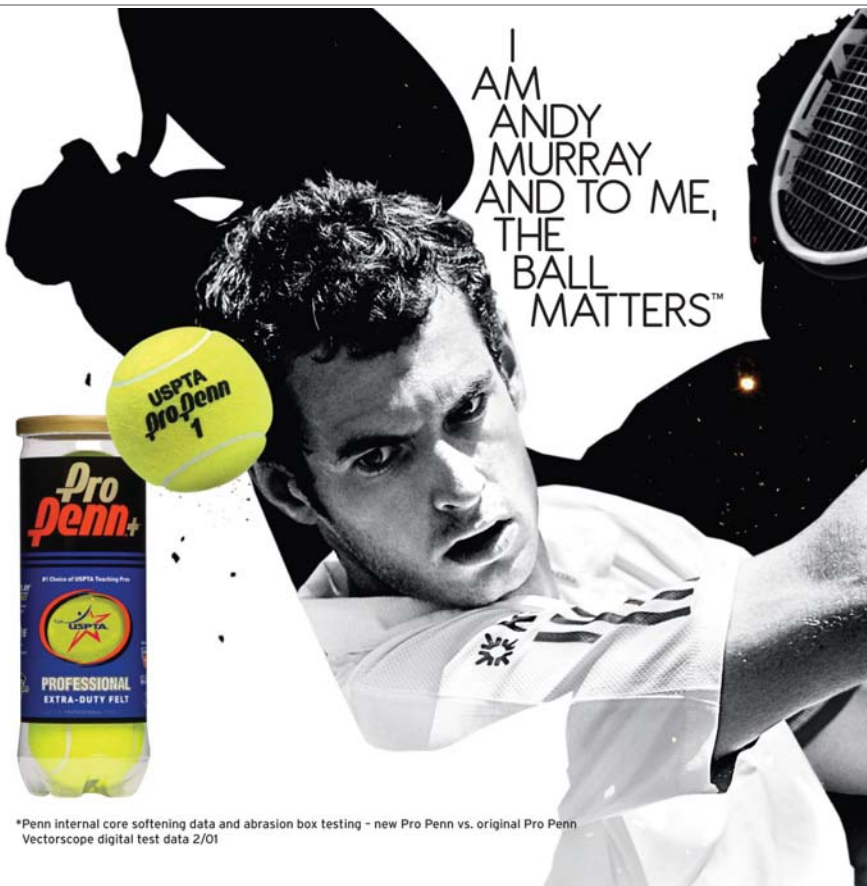
*Penn internal core softening data and abrasion box testing - new Pro Penn vs. original Pro Penn Vectorscope digital test data 2/01

If you change your address, phone, or club, please give USPTA World Headquarters a call at 800-USPTA-4U (877-8248) and ask for the Computer Services Dept. Let them know so you won't miss out on any important national or division news. ●