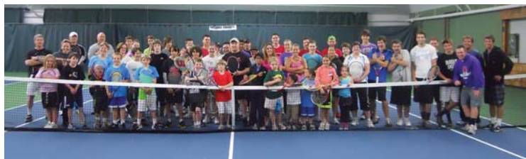
Courthouse Tennis Center hosted 10 & Under Tennis workshop