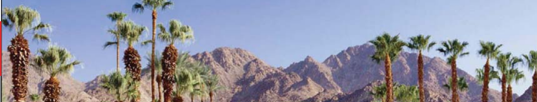
La Quinta Resort & Club in La Quinta, Calif.